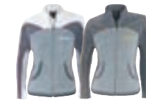
White (01) Charcoal Grey (07)

Sizes: XS, S, M, L, XL, 2XL, 3XL 453357 White (01), Charcoal Grey (07), Ice (38)