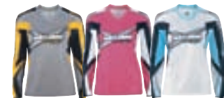
Charcoal Grey (07) Raspberry (39) Light Blue (81)

453312 Charcoal Grey (07), Raspberry (39), Light Blue (81)