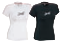
White (01) Black (90)