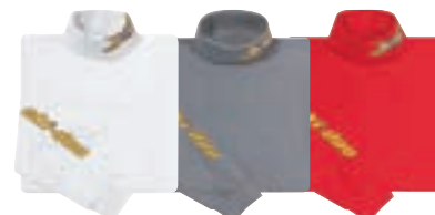
White (01) Charcoal Grey (07) Red (30)