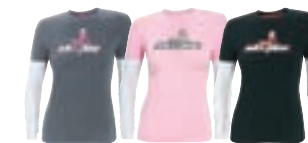
Charcoal Grey (07) Pink (36) Black (90)

453297 Charcoal Grey (07), Pink (36), Black (90)