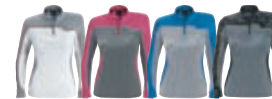
Grey (09) Raspberry (39) Blue (80) Black (90)

Sizes: S, M, L, XL, 2XL 453301 Grey (09), Raspberry (39), Blue (80), Black (90)