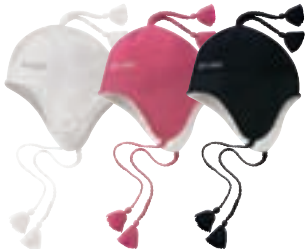
White (01) Raspberry (39) Black (90)