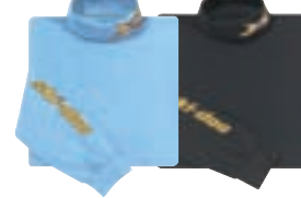
Light Blue (81) Black (90)