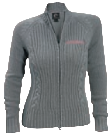
Light Blue (81)