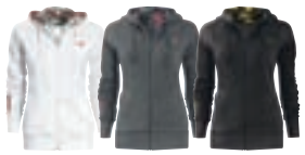
White (01) Charcoal Grey (07) Black (90)

Sizes: S, M, L, XL, 2XL 453318 White (01), Charcoal Grey (07), Black (90)