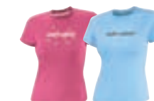
Raspberry (39) Light Blue (81)

453295 Brown (04), Raspberry (39), Light Blue (81)